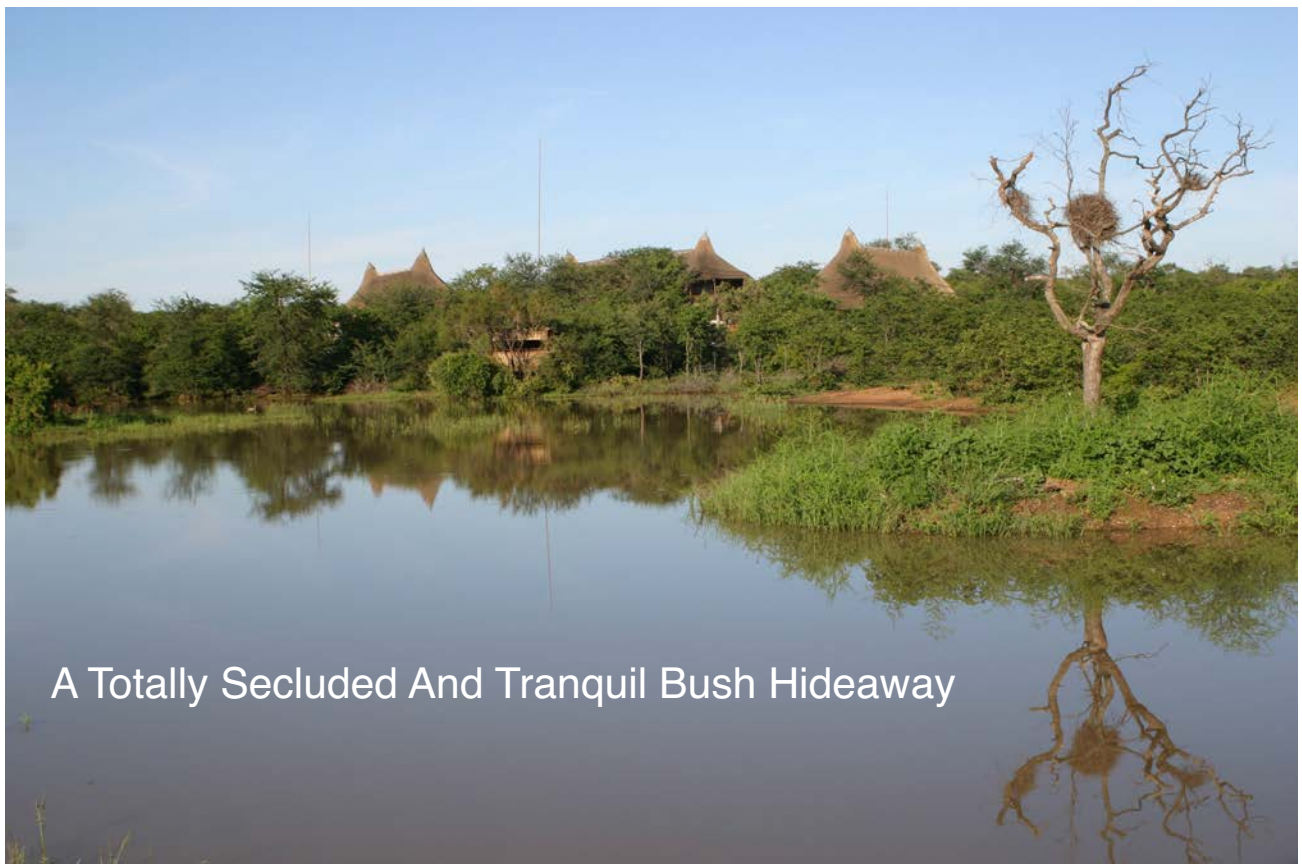
A Totally Secluded And Tranquil Bush Hideaway

Shikumbu Lodge is an unbonded privately syndicated five bedroom (all en-suite) bush lodge uniquely situated on an exclusive 21ha portion of Mahlathini Private Game Reserve. Mahlathini adjoins the Kruger National Park and the Great Letaba Game Reserve (Letaba Ranch) a short distance (7km) north of Phalaborwa. Shikumbu Lodge itself shares a common boundary with the Kruger National Park and offers the ultimate in bush privacy.